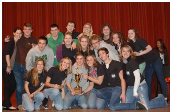
Group A — 2010 Theatre Festival State Champions (second consecutive year!)