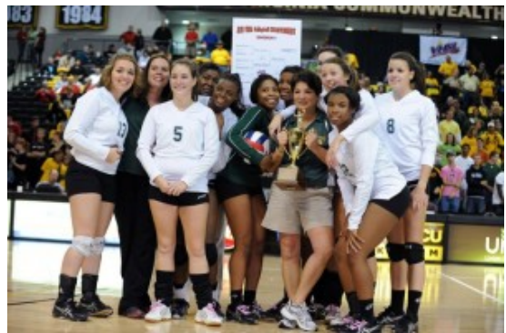
Group A — 2010 State Girl's Volleyball Champions